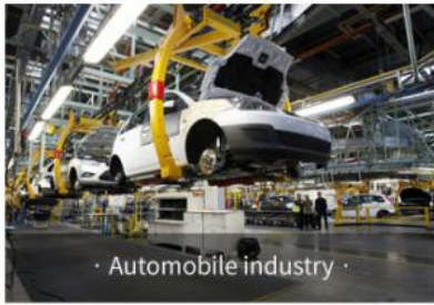
· Automobile industry ·