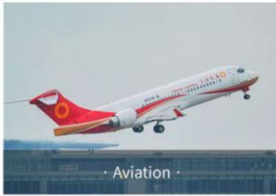
· Aviation ·