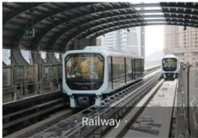
· Railway ·