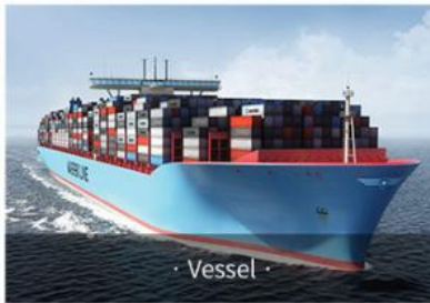
· Vessel ·