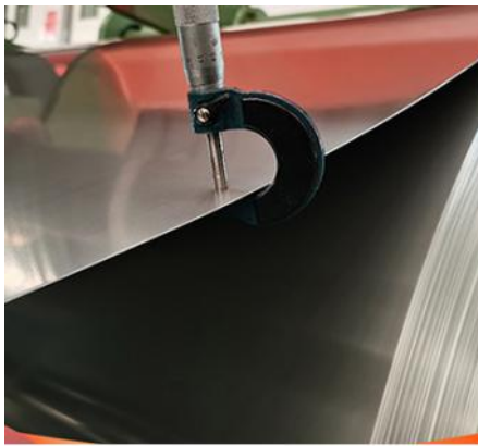
■ PRODUCT INSPECTION